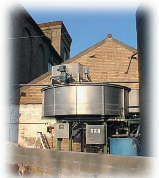
MNC 10 - Tannery effluent