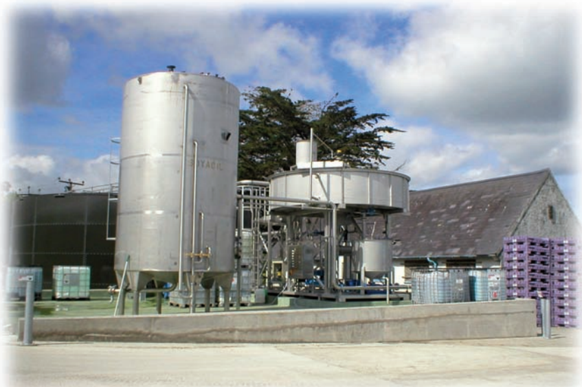
MNC 12 - Cheese making effluent